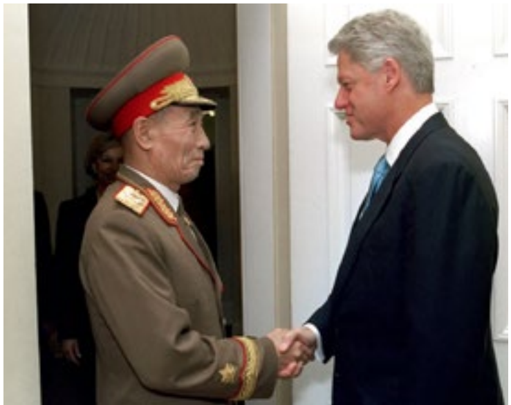
From top: North Korean Leader Kim Jong Il shakes hands with U.S. Secretary of State Madeleine Albright at the Pae Kba Harwon Guest House in Pyongyang Monday, October 23, 2000. Albright, the highest level U.S. official to visit North Korea in 50 years, met with the North Korean leader in an effort to ease tensions between the two nations. President Bill Clinton meets with Special Envoy Vice Marshal Cho Myong-nok, First Vice Chairman of the National Defense Commission of North Korea, in the Oval Office, October 10, 2000.

ing the dispute on the North Korean nuclear program. A peace agreement could also improve international peace and security by including disarmament provisions, in addition to raising the bar for the use of force and establishing the basic conditions for diplomatic relations. 123