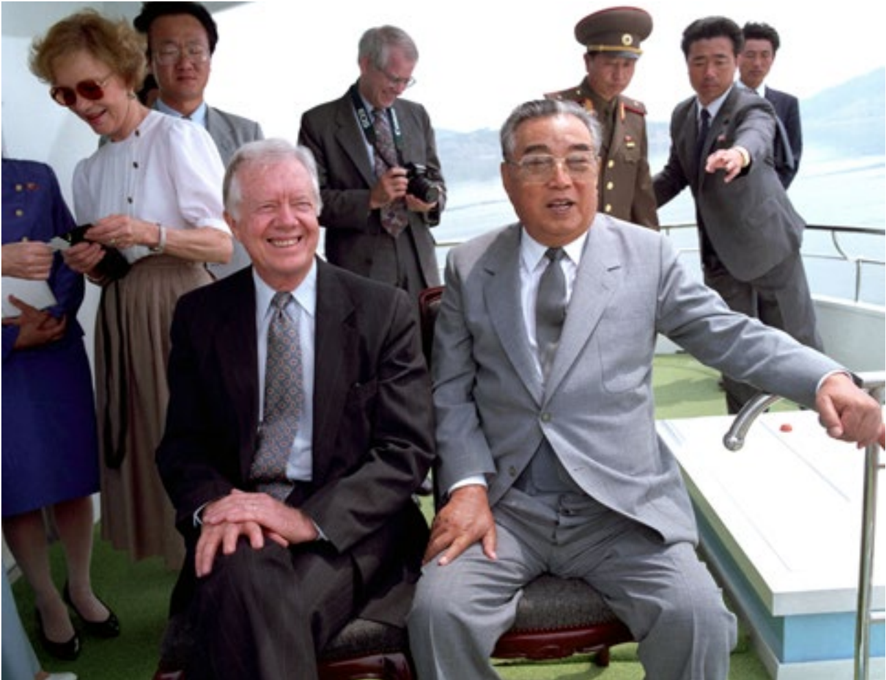
Former US President Jimmy Carter meets with North Korean leader Kim Il Sung to de-escalate tensions, paving the way for the Clinton administration to conclude the Agreed Framework four months later. June 17, 1994.

legal positions of the parties in the nuclear dispute, and peace may be politically more conducive to international peace and security than delaying or denying it in an unlikely bid to disarm one side.