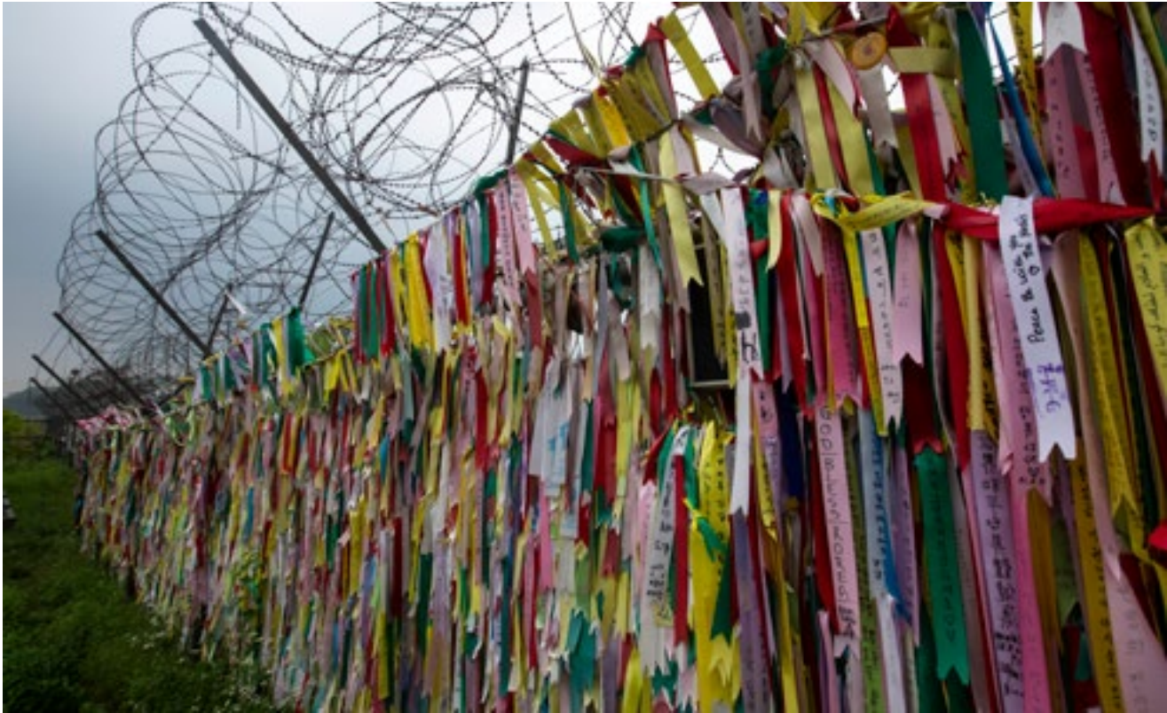
Thousands of prayer ribbons wishing for peace and reunification are tied at the fence of the Demilitarized Zone at Imjingak, South Korea.

cial and a duty in itself. The parties should refrain from instrumentalizing the prospect of a peace agreement as a bargaining chip for subjects beyond the use of force. These subjects should be negotiated on the basis of reciprocity and fairness. Any deviation from these principles changes the nature of negotiations and reduces the likelihood of peace.