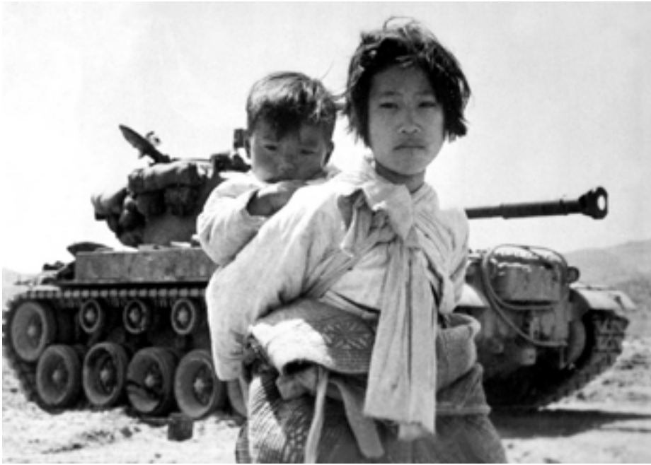
With her brother on her back, a war-weary Korean girl trudges by a stalled M-26 tank at Haengju, Korea, June 1951.

participants from South Korea, Japan, the United States, Russia, and China that paralleled the official government six-party talks from 2008 to 2012. The Northeast Asian Women's Peace Conference, held in Seoul and Washington, aimed at resolving the North Korean and Northeast Asia nuclear issue. It was organized by congresswomen, scholars, and civil society organizations to develop models of women's participation in 1.5-track negotiations (diplomacy involving official and nonofficial participants) in the peacebuilding process on the Korean Peninsula. It also contributed to improving the global leadership of the Korean women's peace movement and provided an opportunity for women from five Northeast Asian countries to engage in international solidarity activities toward the denuclearization of the Korean Peninsula and the establishment of a peace regime in Northeast Asia. Unfortunately, North Korean women did not participate in this conference due to tensions in North-South relations following the death of a South Korean tourist at Kumgang in 2008.