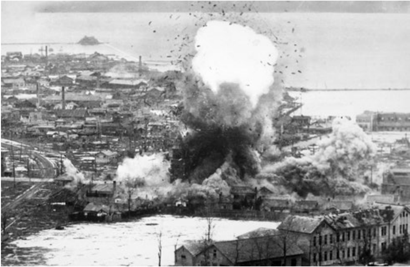
US bombers destroy supply warehouses and dock facilities in Wonsan, North Korea, in 1951. The Korean War devastated the Korean Peninsula, resulting in more than 4 million casualties.

would foster, including much-needed military de-escalation and trust-building.