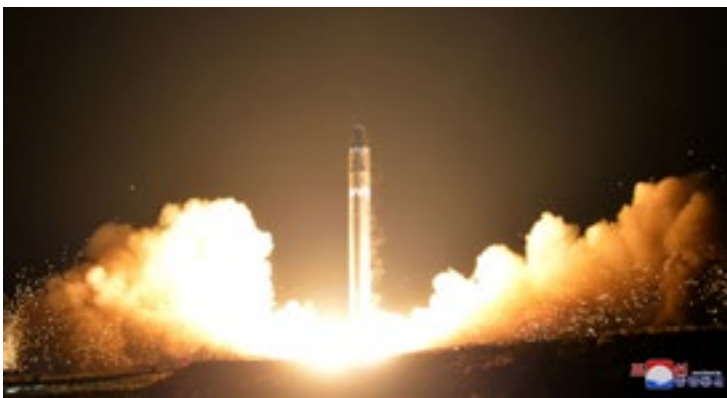
From top: U.S. armed forces test a Minuteman III intercontinental ballistic missile on May 3, 2017, at Vandenberg Air Force Base, California. Credit: U.S. Air Force photo/2nd Lt. William Collette; North Korean armed forces test a Hwasong-14 intercontinental ballistic missile on July 20, 2017 in Chagang province, North Korea. Credit: KCNA

in the argument that the United States was a UN agent rather than a belligerent is that the UN had, in practice, no control over the UNC or its affiliated troops. The United States made all combat decisions and reported them to the UN only after the fact. 83 The UNC went beyond the Security Council mandate of repelling the North Korean attack of June 1950 by crossing the border northward in the name of restoring peace and security, invading the North, and triggering a Chinese counter-intervention. Adding in the devastating human impact, it is clear that under any definition, the Korean War was a war.