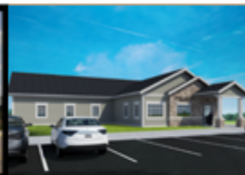
Monon 420 N Market 877-797-2404