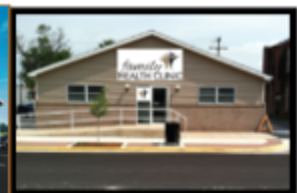
Wolcott 128 W Market 219-747-2067