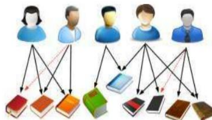
Figure 3.2.1.1 Collaborative Filtering for Book Recommendation

The collaborative nature of this approach is apparent when the model learns the embeddings. Suppose the embedding vectors for the movies are fixed. Then, the model can learn an embedding vector for the users to best explain their preferences. Consequently, embeddings of users with similar preferences will be close together. Similarly, if the embeddings for the users are fixed, then we can learn movie embeddings to best explain the feedback matrix. As a result, embeddings of movies liked by similar users will be close in the embedding space.